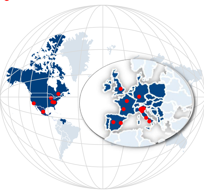
International footprint with presence in Italy, France, Spain, Germany, UK and North America with a total of 18 subsidiaries/offices (7 Labs)